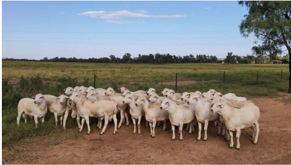
Flock Rams (Shorn)